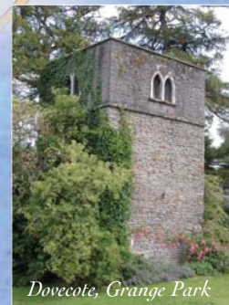
Dovecote, Grange Park