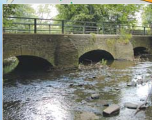
Mill Road Bridge - Winterbourne