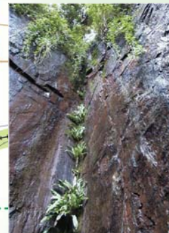
Pennant Sandstone rockface, Huckford Quarry

Bury Hill has the remains of an Iron Age hill fort. It had a splendid strategic position, with fine views over the surrounding countryside. There are some wonderful ancient oaks on the ramparts of the hill fort, covered with mosses and ferns and home to rare beetles. The steep slopes below the fort are wooded and many of the trees are multi-stemmed as a result of centuries of coppicing, when trees were cut to encourage new stems to grow from the stumps.