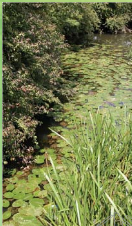
Frome north of Winterbourne Viaduct

North of Winterbourne Viaduct the valley broadens and the Walkway follows the river through fields, pastures and copses. Traditional wildflowers like knapweed and yarrow grow here and on sunny summer days there can be clouds of damsel flies and butterflies. There are old pollarded willows on the river bank,