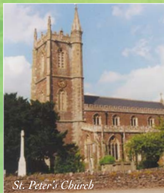
St. Peter's Church